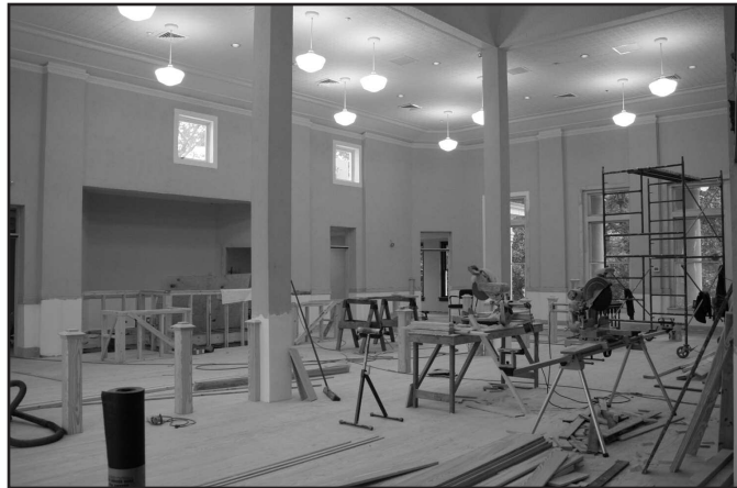
The second-floor courtroom under construction.

puters and other courtroom technology, security measures and handicapped access. The architectural integrity of the original structure has been carefully reclaimed over the past three years. Craftsmen have