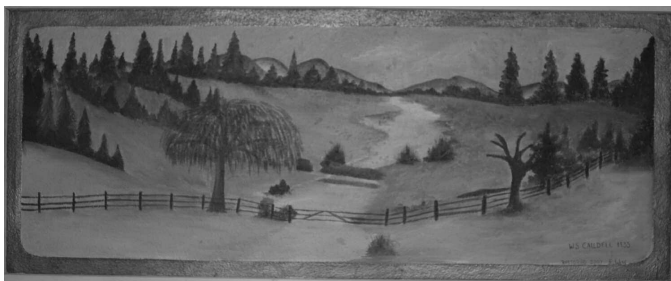
This mural, painted in the 1930s, was uncovered during the renovation.

painstakingly washed away a century's worth of paint and grime to reveal the original colors and décor. A mural depicting a pastoral scene was discovered in the former county clerk's office; it had been painted sometime in the 1930's by a local artist.